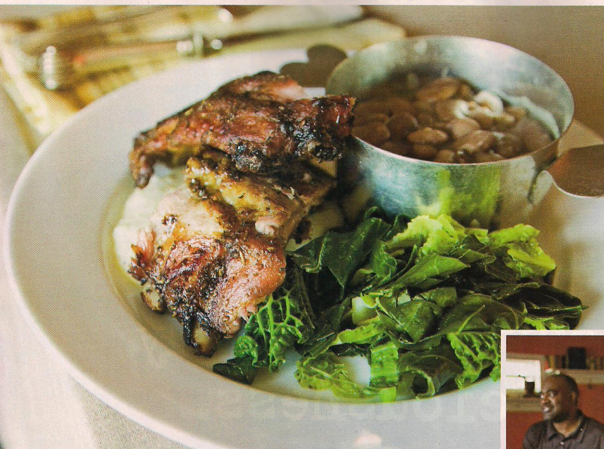
LEFT: Slide up to a plate of Baby Back Ribs, savory Butter Beans, Smoked Gouda Cheese Grits, and simple wilted savoy cabbage.